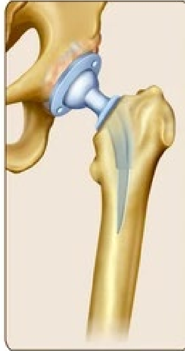
Replaced Hip Joint