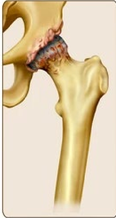
Damaged Hip Joint