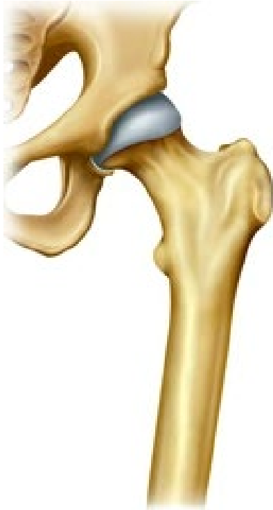
Healthy Hip Joint